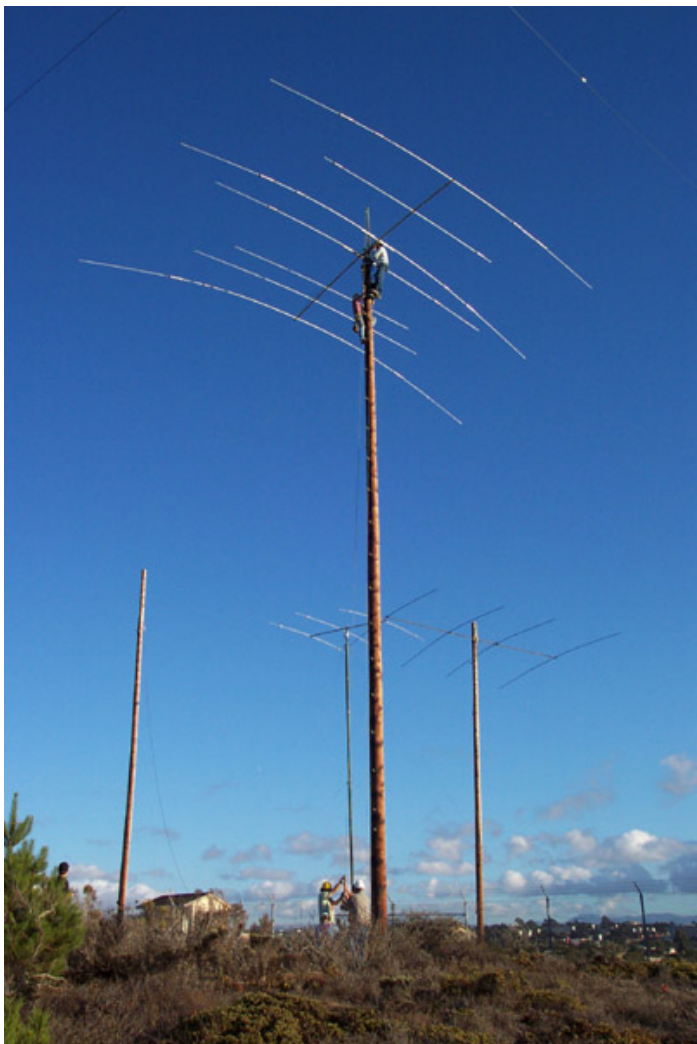
K6XX and WA6HHQ Install PRO-67C at N6IJ